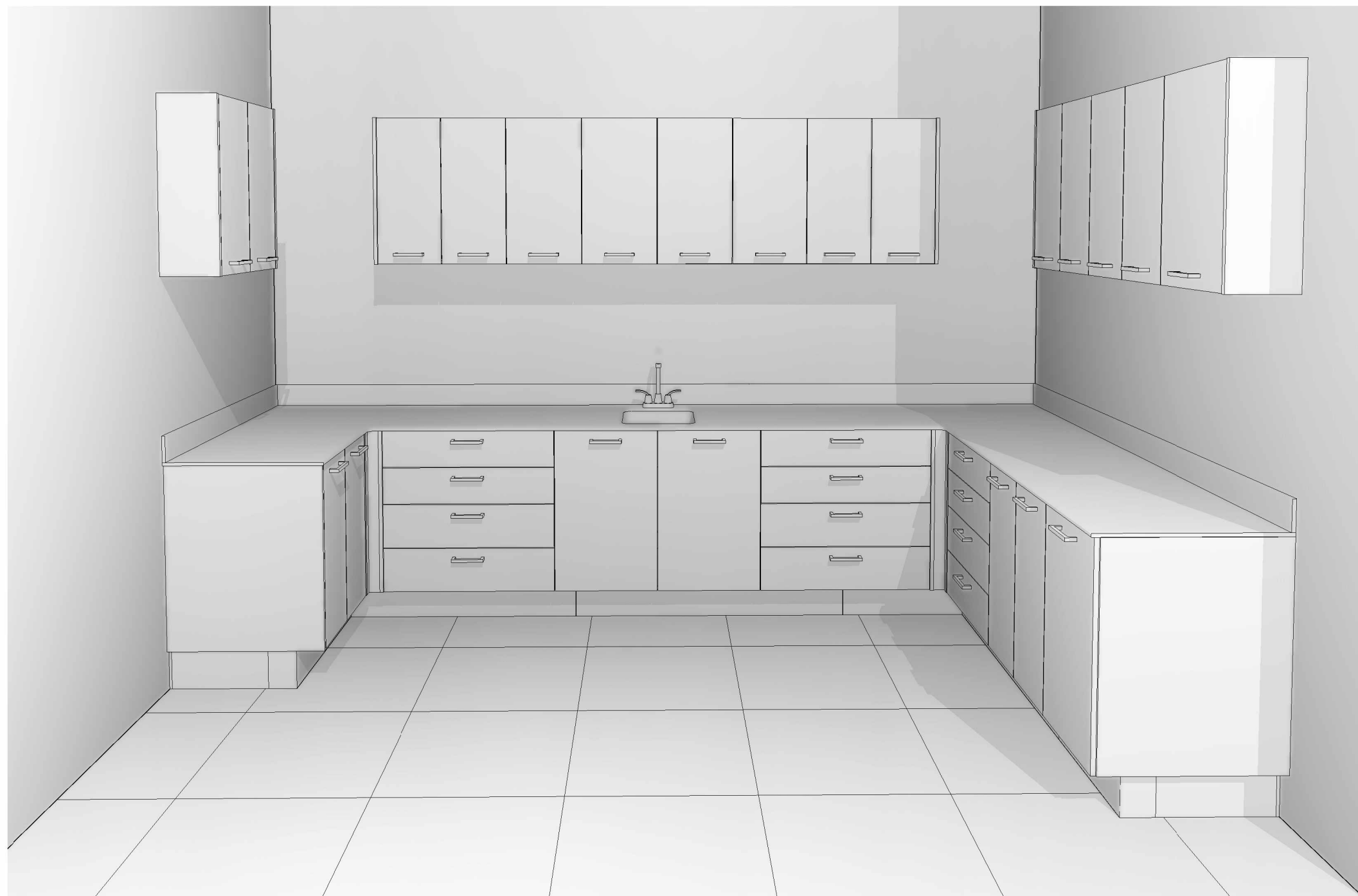
3 3D View I